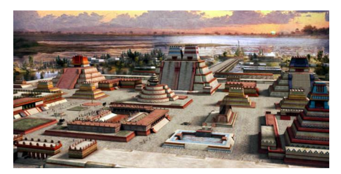
This is an artist's drawing of the capital city, Tenochtitlan. Credit: https://mexicanroutes.com/tenochtitlan/

The capital city, Tenochtitlan, was the center of trade. People came to the capital to trade crops, pottery, and clothing. They also traded luxury items, like tropical bird feathers and cotton. They traded goods with other Aztecs and with people in other empires, like the Mayas. Because of trade, the Aztecs built a strong economy.