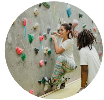
Rock Climbing Gym

An area inside where you can play even if the weather is bad.