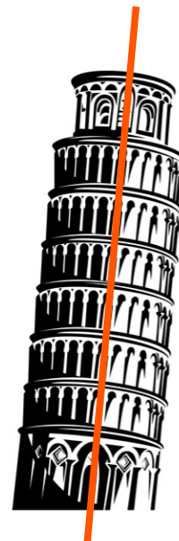
Leaning Tower of Pisa

If it is symmetrical, draw at least one line of symmetry.