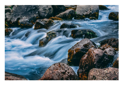
Water is needed for animals to survive.