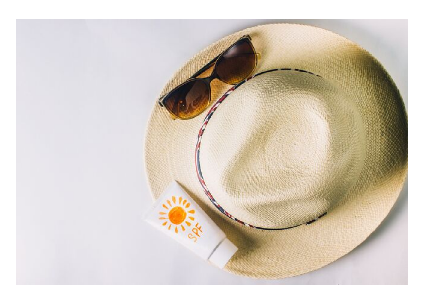
Methods that are used to help block skin from sunlight.