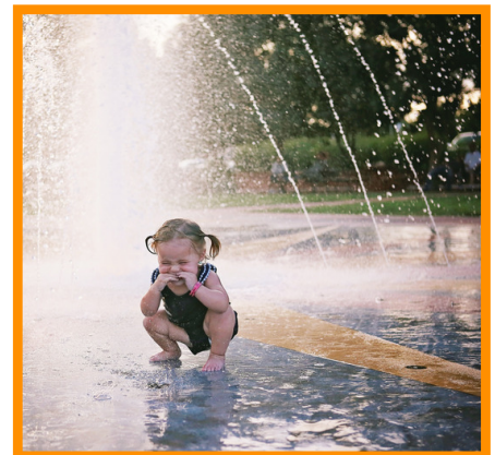
A Splash Pad