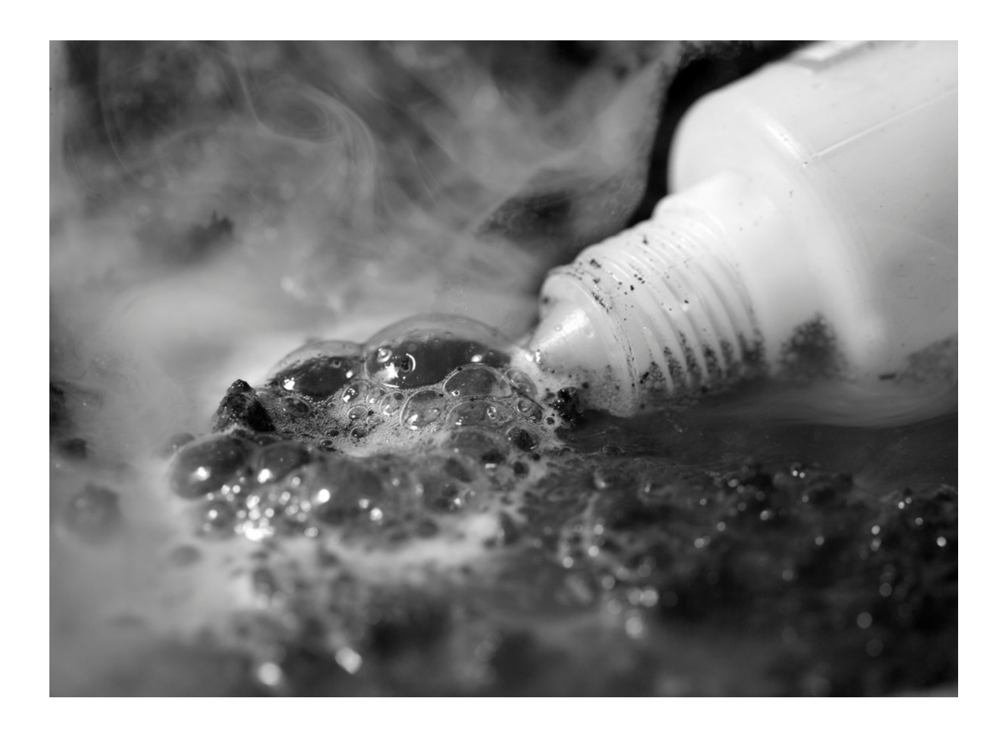
A chemical substance that is typically corrosive.