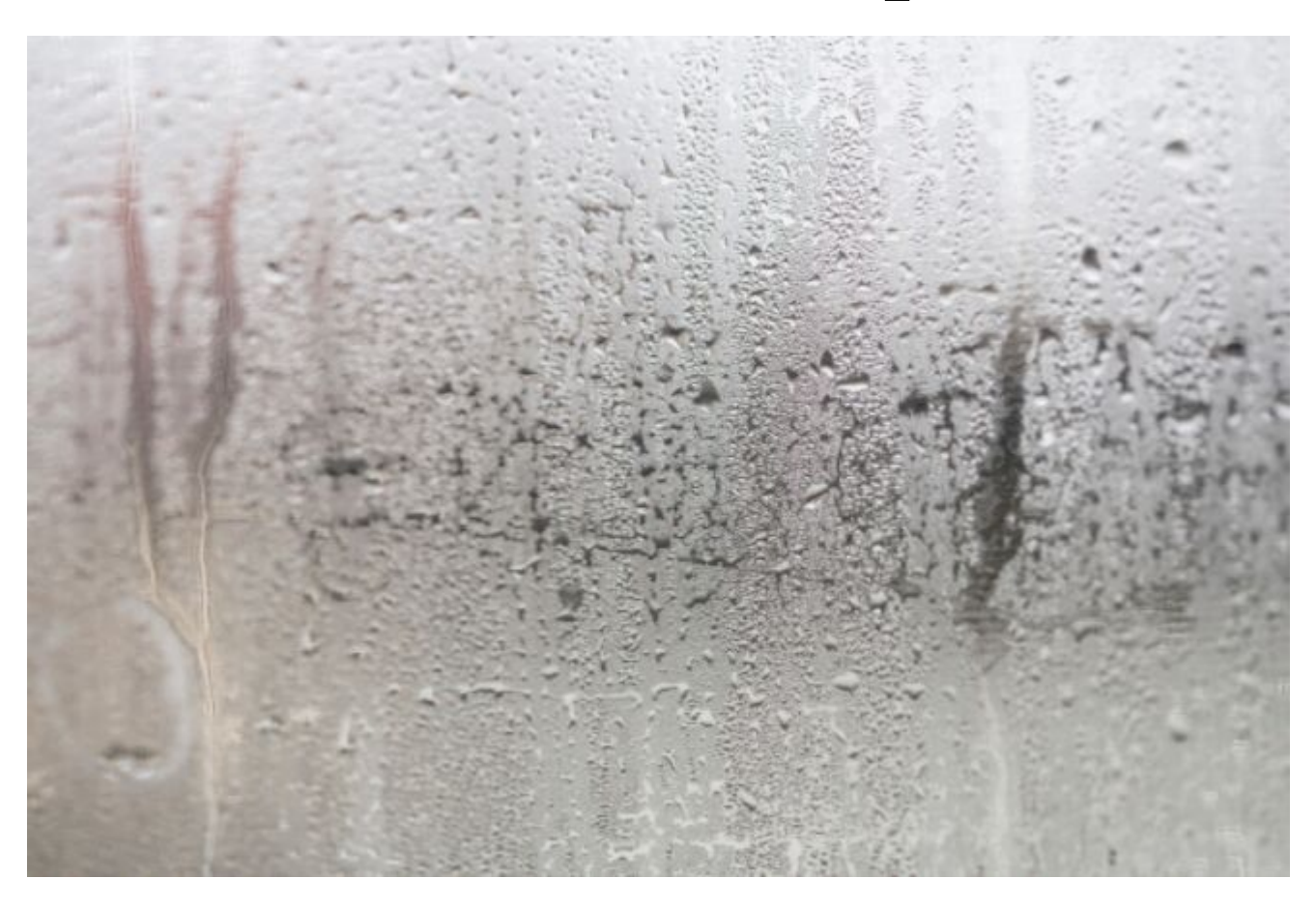
Degree of wetness.