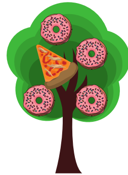
Donut and Pizza Tree