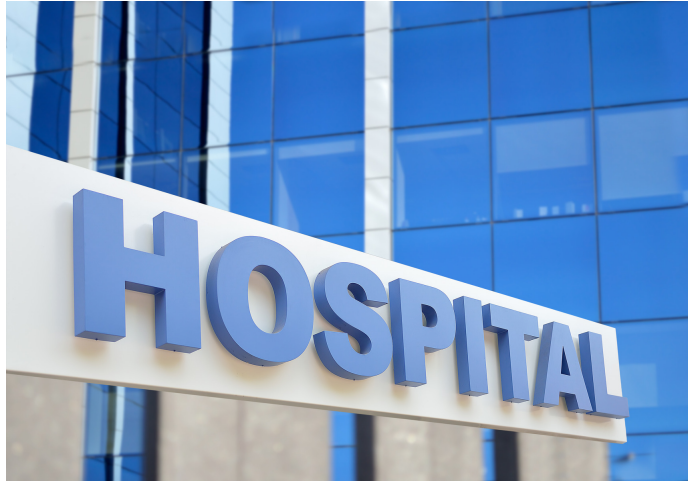
Dermatologists can work in a hospital