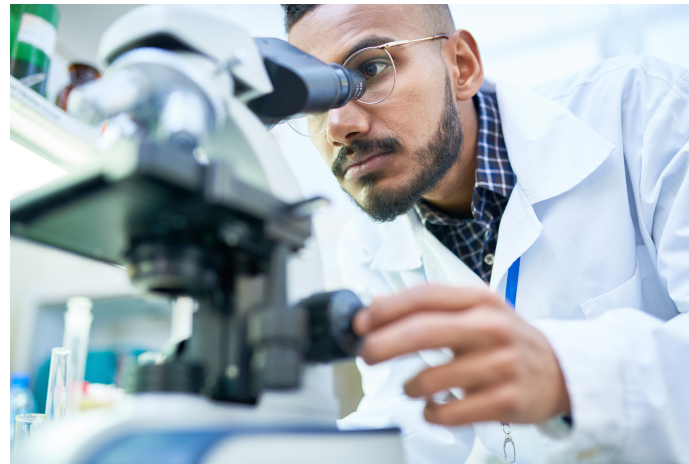
or in a lab (where they can see the skin up close under a microscope. They can also run special tests or science experiments to see how medicine affects the skin)