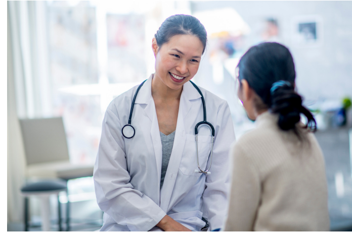
or a doctor's office